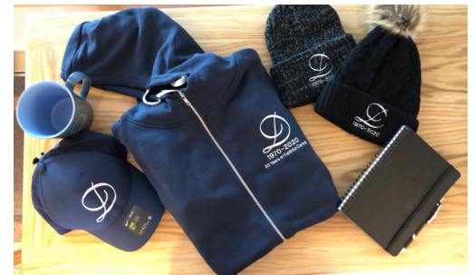
Donwood SWAG - Available for purchase.

Purchase can be made at the front reception at 171 Donwood Drive, Monday to Friday between 9:00 am - 3:00 pm OR email info@donwoodmanor.org .