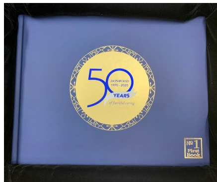
The Donwood Story - The First Book Edition