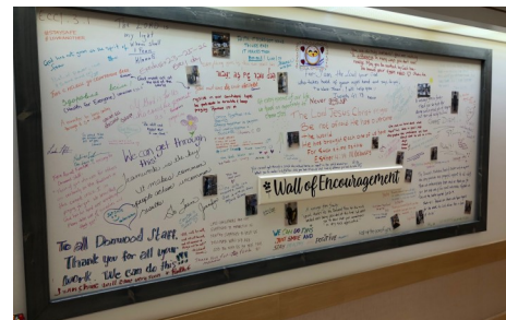
Wall of Encouragement

A wonderful reminder that we are not in this alone.