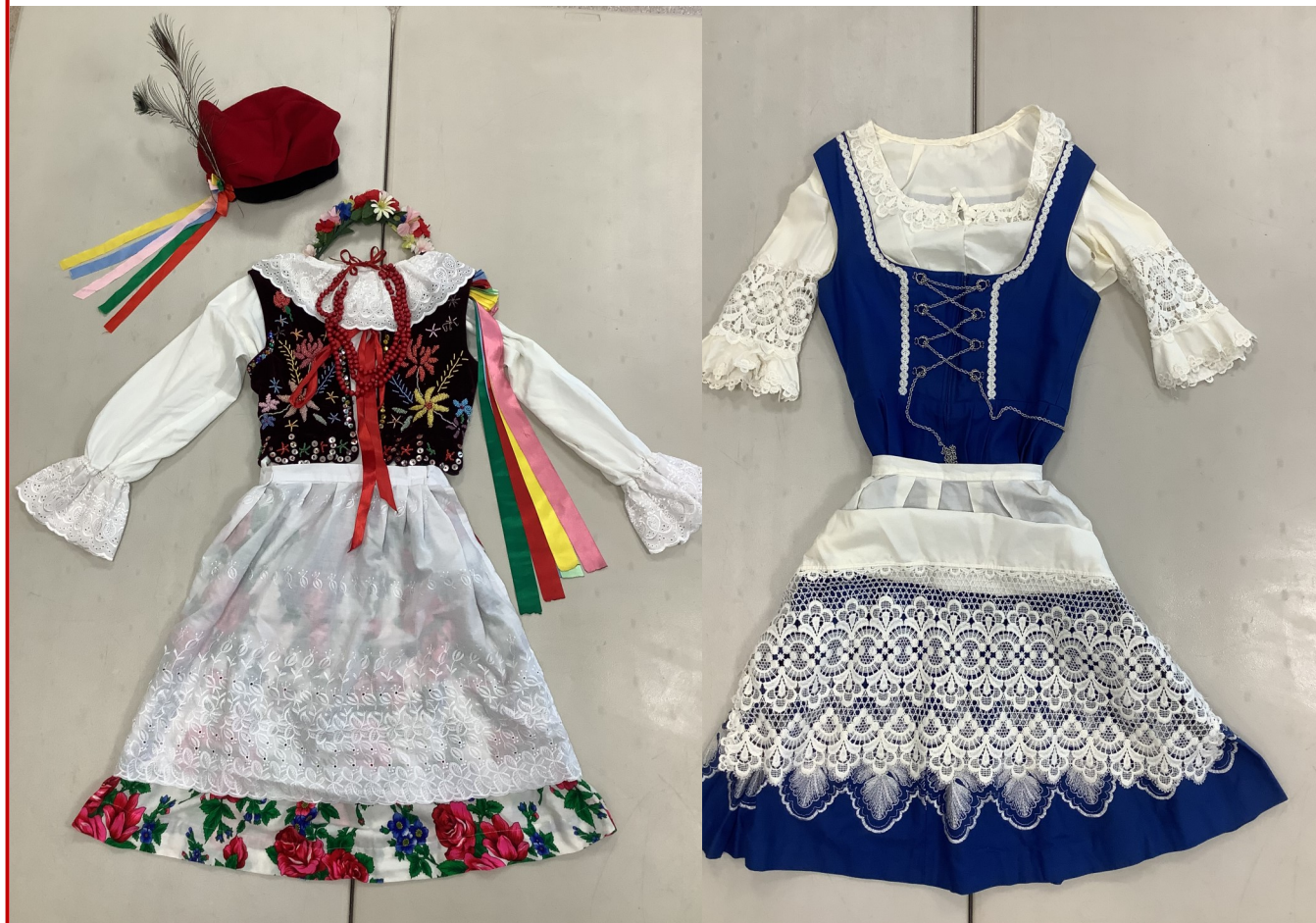
Traditional Dress from Portugal