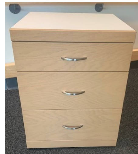
Donwood Comfort Care Carts

We wish to thank the Donwood Auxiliary for providing the funds for this project. The care of our seniors is the heart of the Auxiliary and they considered it a great privilege to support this project.