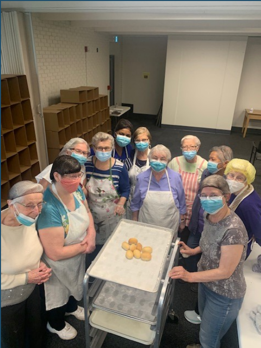
Donwood Auxiliary members wishing the last of the meat buns farewell. 2650 buns were made for our Pastoral Care Fundraiser!